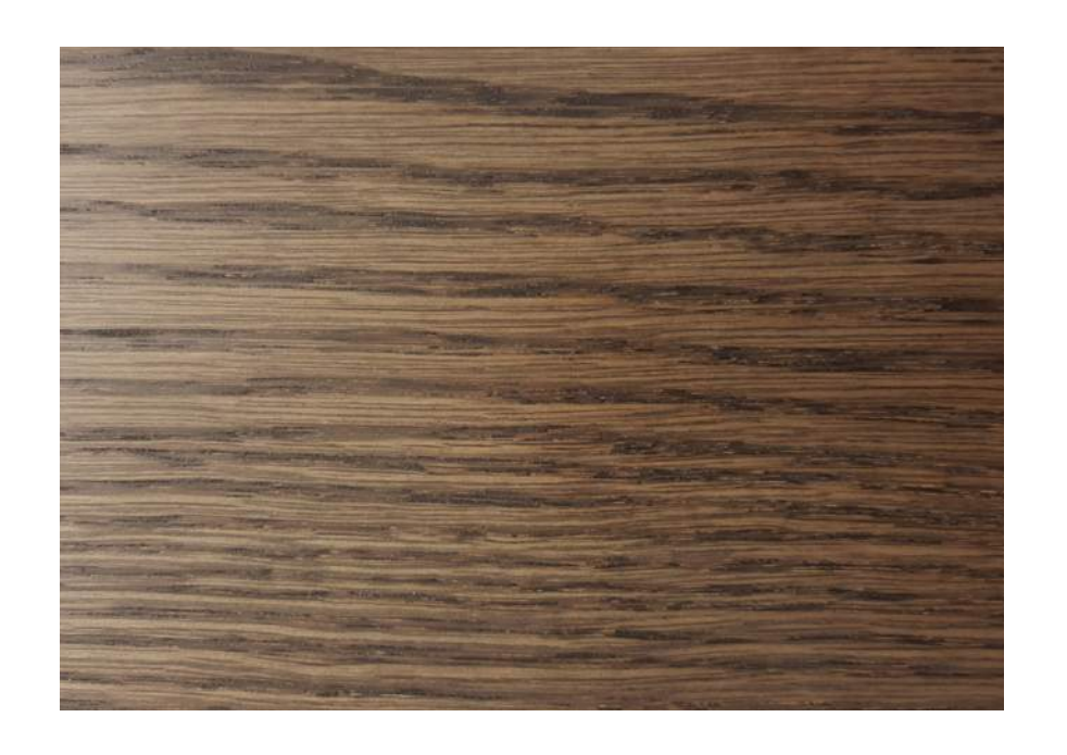
CASEWORK INTERIOR ARTS – PLASTIC LAMINATE COLOR(S): 2023LIN ASH VEIL

MARSHFIELD-ALGOMA – ASPIRO SERIES COLOR(S): RED OAK – PLAIN SLICED – CUSTOM COLOR 266347C